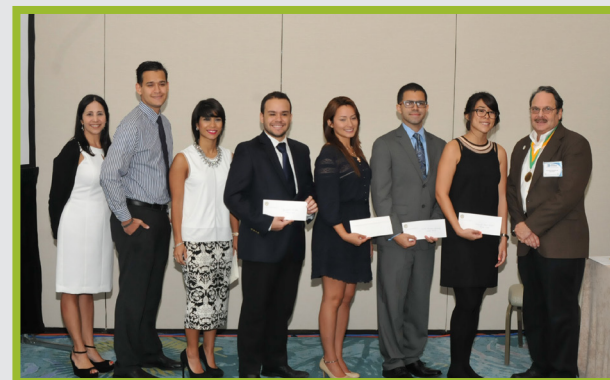
Student's received scholarships at the 56th. convention