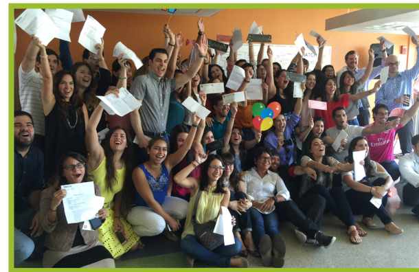
Class of 2016 - Match Day

President, Sociedad Médicos Graduados Escuela Medicina UPR